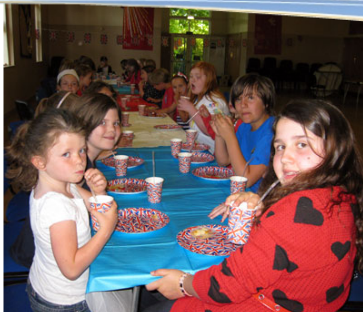
Girls enjoying the Royal Wedding Party at our Centre

Our first meeting of this term was a Royal Wedding party for both units. Girls came in red, white and blue, played games on a 'Royal' theme and, of course, enjoyed party food. At the moment both units are busy working on challenges connected to the number 40 as the County Holiday House at Egton is celebrating its fortieth birthday this year.